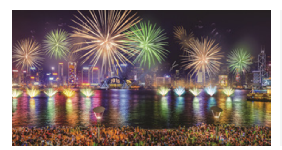
The Hong Kong New Year Countdown Celebrations event was title-sponsored by

Hong Kong WinterFest reached its climax on the New Year's Eve of 2015 with the CTEG Hong Kong New Year Countdown Celebrations. The eight-minute fireworks display mesmerised 336,000 spectators on both sides of the Victoria Harbour, and many more who enjoyed it via satellite broadcast.