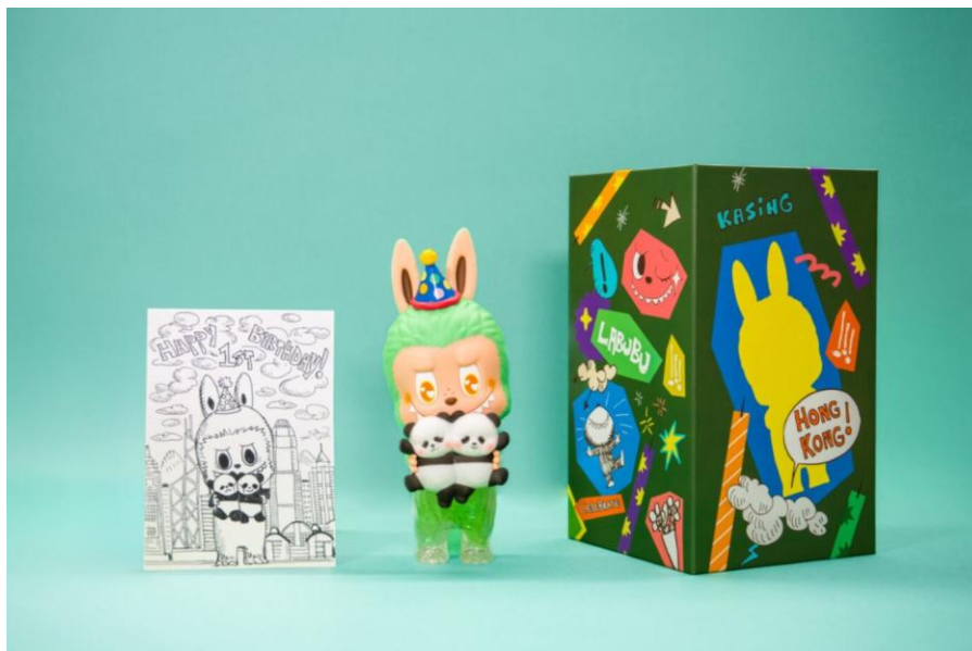
The LABUBU x Panda Twins gift box includes a special-edition LABUBU and a birthday card showing LABUBU celebrating the pandas’ birthday against a backdrop of Victoria Harbour.