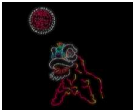
The auspicious dancing lion brings a touch of happiness to the performance.