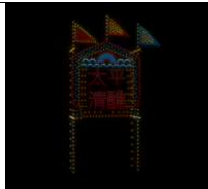
The flower board is one of the focuses of the annual Bun Festival. The nightscape will recreate this sophisticated craftsmanship with the modern drones.