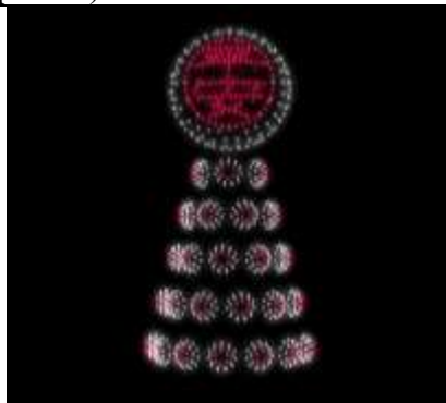
A 3D bun tower measuring about 60m stands about 4 times the traditional bun tower. A 30m giant lucky bun tops the tower.