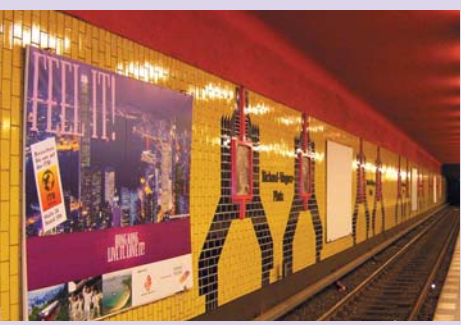
▲ The HKTB undertakes an advertising campaign on Berlin's U-bahn system during ITB 在「國際旅遊展覽」期間,旅發局在柏林地下鐵推出 廣告宣傳

in a joint promotion of all four destinations to create mutually beneficial synergies. Entitled Together in Asia, the dinner was supported by a poster campaign in London and Manchester in February and March that was supported by four tour operators.