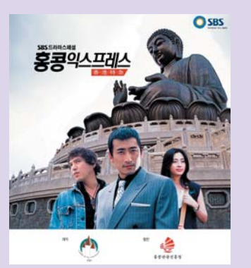
▲ The TV drama Hong Kong Express introduces many facets of the city to Korean viewers 「香港特急」電視劇向南韓電視觀眾展示香 港多層面的吸引力