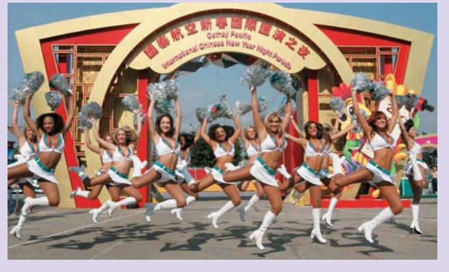
The Miami Dolphins Cheerleaders add a touch of glamour to the 2005 International Chinese New Year Night Parade 邁亞密海豚啦啦隊為「2005新春國際匯演之夜」增添不少魅力

To help promote the 2004 Hong Kong Shopping Festival from 26 June to 31 August, the HKTB partnered with Lucky , a specialist shopping magazine with print and online editions. This provided an excellent platform for publicising the 2004 Hong Kong Shopper of the Year contest, which was a mechanism for stimulating shopping expeditions to Hong Kong in support of the main shopping festival. With contestants picked from 15 markets, a month-long sweepstakes with Lucky provided the mechanism for selecting contestants from the US. The winners received two round-trip air tickets to Hong Kong and hotel accommodation to participate in the final part of the contest in late July. This helped to build publicity for the 2004 Hong Kong Shopping Festival and played a role in encouraging visitors to book packages to Hong Kong.