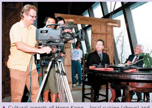
▲ Cultural aspects of Hong Kong – local cuisine (above) and Chinese medicine (right) – are featured in the US TV show Breakfast with the Arts 美國電視節目 Breakfast with the Arts,介紹香港的文化 特色,包括地道美食(上)及中國醫藥(右)