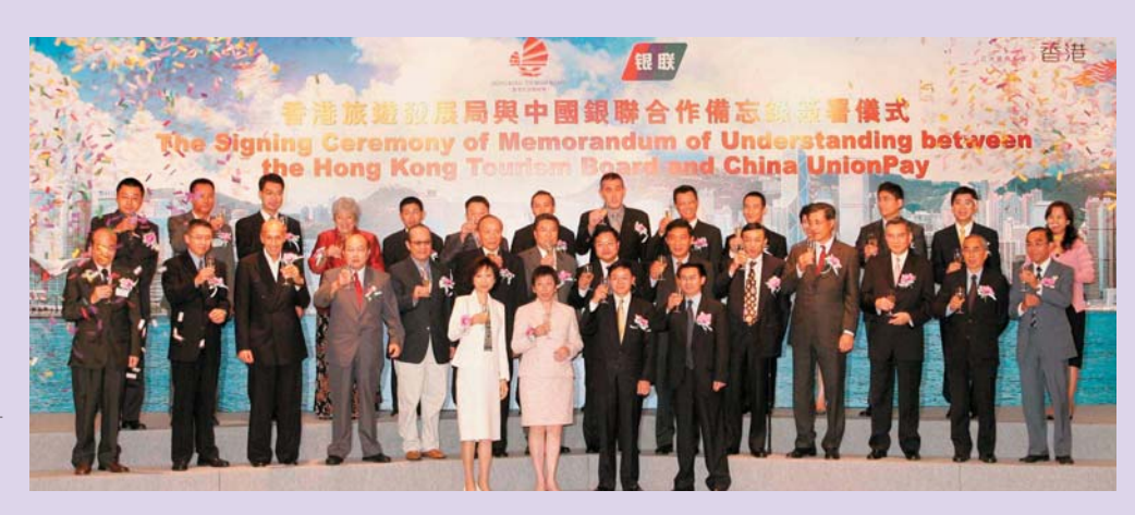
The memorandum of understanding between the HKTB and China UnionPay Co Ltd in 2004 is aimed at stimulating spending by Mainland visitors 旅發局與中國銀聯於2004年簽訂 合作備忘錄,積極推動內地旅客 在港消費

In a highly productive joint promotion, the HKTB and China UnionPay (CUP) Co Ltd showcased Hong Kong as the first city outside Mainland China where the CUP cards can be used. By marketing Hong Kong as the premier travel destination to the CUP card customer base, the HKTB aims to offer more business opportunities for Hong Kong's tourism-related sectors, including travel, retail and catering, as well as a new business platform for Hong Kong's banking industry. Mainland visitors were able to use their CUP cards in Hong Kong starting January 2004 and the first co-operative promotional initiative came in the run-up to the National Day Golden Week in October. China UnionPay encouraged spending in Hong Kong by staging a promotion offering 6,000 prizes, with publicity efforts augmented by travel agencies in Shanghai, Beijing and Guangzhou, and supplemented by advertising on radio and the Internet. Both the HKTB and China UnionPay promoted the Quality Tourism Services (QTS) scheme under their joint promotions.