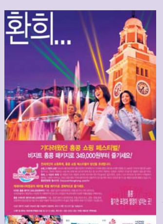
A Hong Kong Shopping Festival promotion in South Korea 在南韓推廣「香港購物節」

There were many other successful promotions, including a co-operative newspaper advertising campaign with three online travel agencies which targeted students and office workers. Also, a popular Magic Lamp guide to Hong Kong was produced with the support of the HKTB. In recognition of its promotional work generally and for publications such as Magic Lamp , the HKTB received The Best Tourism Publication Award at Tour Expo Daegu 2004.