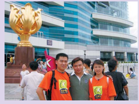
Representatives of Mainland media visit popular attractions during a familiarisation trip to Hong Kong 內地傳媒代表來 港考察期間參觀 著名景點

development of the outbound market in the provinces concerned. Another factor stimulating demand is the trend towards same-day consumption visits to Hong Kong from Guangdong province, while weekend trips continue to remain popular.