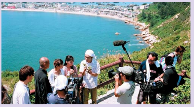
▼ Special Hong Kong Shinhakken TV coverage features unique aspects of Hong Kong, including green attractions (left) and local culinary culture (right) 在「香港新發現」推廣計劃期間,特備電視節目向觀眾展示香港的旅遊特 色,包括:郊野景致(左)及地道美食(右)