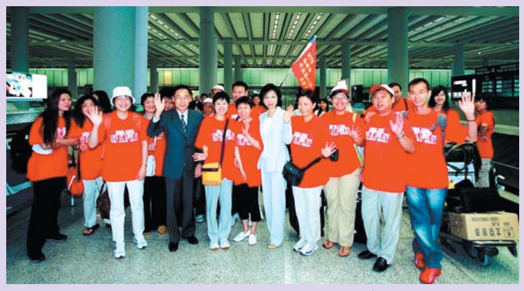
▲ The HKTB gives a personal welcome to 200 individual visitors from Beijing 旅發局熱烈歡迎200位來自北京的「個人遊」旅客

Turning its attention from Guangzhou to Beijing, the HKTB welcomed 200 individual visitors from Beijing at Hong Kong International Airport in September. This initiative was part of the 1,000 Beijing Individual Visitors to Hong Kong consumer promotion jointly organised by the HKTB and Beijing Tourism Administration (BTA). Following the extension of the IVS to Beijing in September 2003, the HKTB continued strengthening its partnership with the BTA.