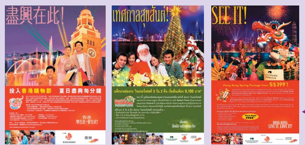
Advertising on Mega Events targets various markets in South & Southeast Asia 旅發局在南亞及東南亞不同市場推 出廣告,宣傳大型活動