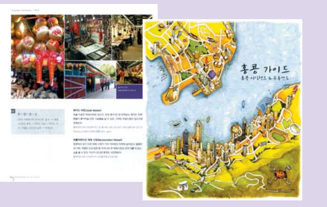
▲ The award-winning Magic Lamp guide in South Korea 在南韓獲獎的《Magic Lamp》旅遊指南