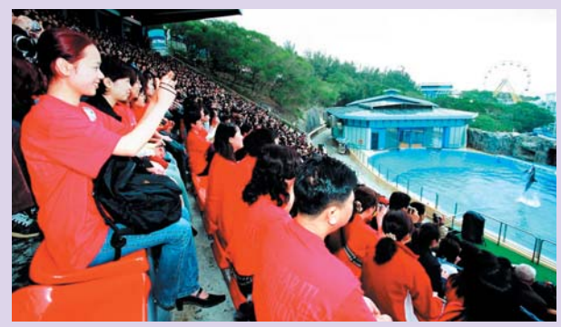
▼ A Romancing Hong Kong tour group from Taiwan visits the city 參加「心動香港」観光團的台灣旅客享受在港旅程