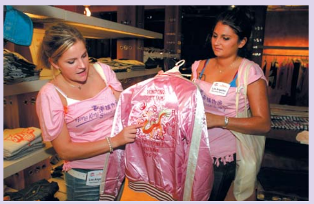
▲ The US Shopper of the Year team goes in search of bargains 參加「2004香港購物通」的美國參賽隊伍搜羅價廉物美的商品