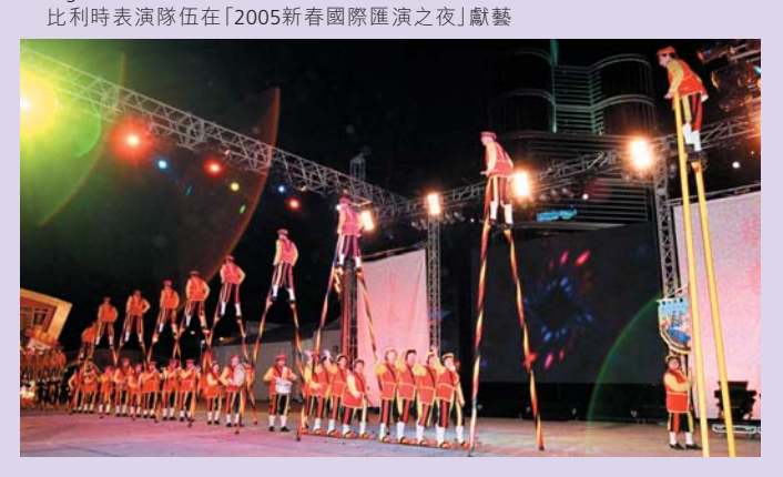
Belgian performers take part in the 2005 International Chinese New Year Night Parade

additional roadshows were held with Geoplan in Germany in August, Voyageurs Associes in France in October, and the Pacific Asia Travel Association (PATA) in Germany in November.