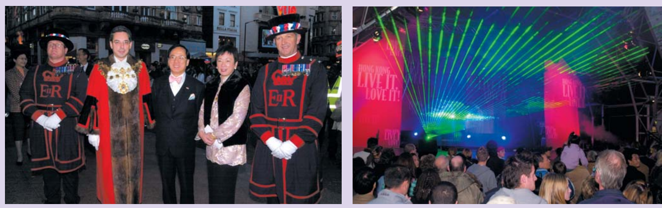
▲ The HKTB presents the Aqua Fantasia show to UK consumers in London 旅發局在倫敦向當地人士推介「光影水躍」激光水幕匯演

Hong Kong continues to benefit from the current and growing popularity of China in many European markets.