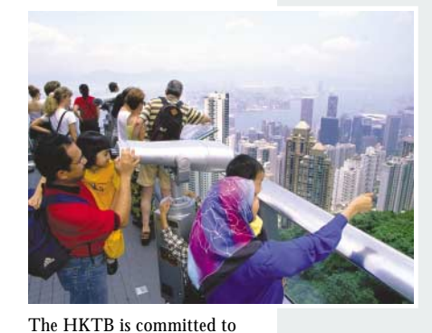
maintaining a balanced portfolio of visitors in terms of source markets and demographic segments 旅發局致力維持一個均衡的客源市場和客群組合

The HKTB is also working to attract further the family market, especially from regional destinations where there is a pronounced trend for families to travel as a single unit. With the support of airlines, hotels, ground operators, retailers and restaurants, we are in the process of developing a range of packages and promotions aimed at family groups,