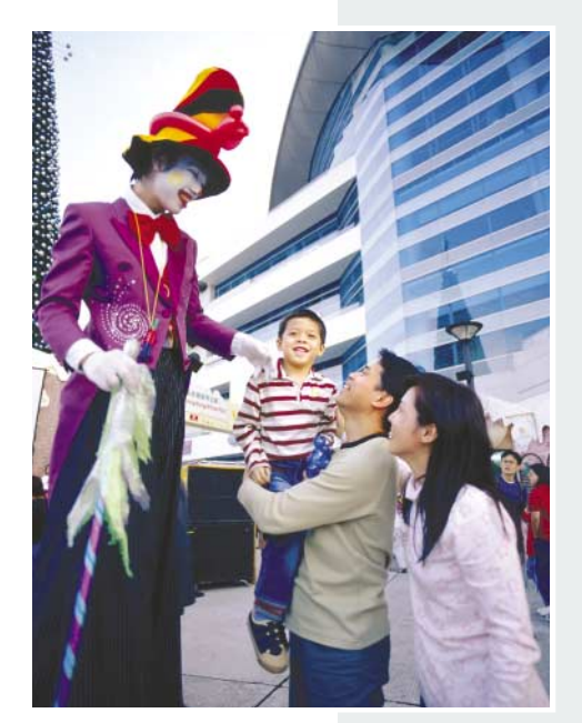
The HKTB strives to grow the family segment, which offers considerable market potential