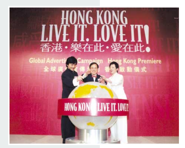
Launch of the Hong Kong – Live it, Love it! global advertising campaign 「 香港 – 樂在此,愛在此! 」全球 廣告宣傳活動啟動儀式

回顧整件事件,旅發局能成功處理危機,全賴香港的業界,包括酒店、食肆、商場、交通運輸機構及旅遊經營商等,採取更嚴格的清潔和衛生措施,這些措施日後更成為業內的標準運作守則。政府、旅遊業界和社會各界亦發揮空前的團結精神,不但成功控制疫情,更同心協力吸引旅客盡快來港。