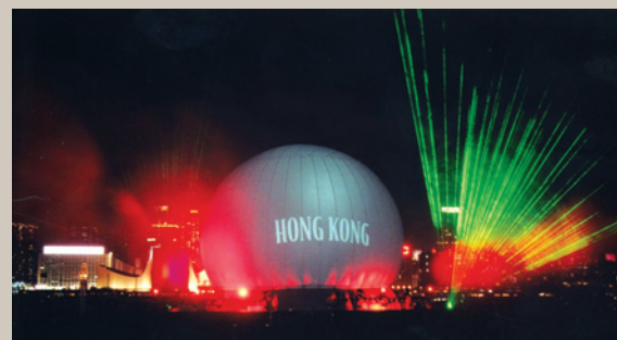
The multimedia Strato-Fantasia show was a highlight of the Hong Kong Welcomes You! promotion

面對挑戰，我們必須繼續投放資源興建新的旅遊景點和旅遊基礎設施，保存我們的文化古蹟和傳統，以及提升和維持香港旅遊業領導同儕的服務水平。我們要確保香港能超越每一位旅客的期望，向旅客保證香港這世界其中一個頂級的旅遊勝地，能為他們提供完美的優質卓越服務。