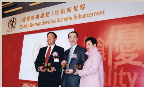
Enhancements to the HKTB's Quality Tourism Services (QTS) scheme were announced in December 2003