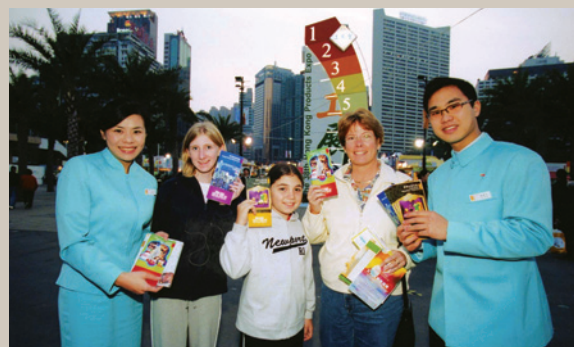
The Tourism Orientation Programme (TOP) raises hospitality standards while training front-line tourism staff