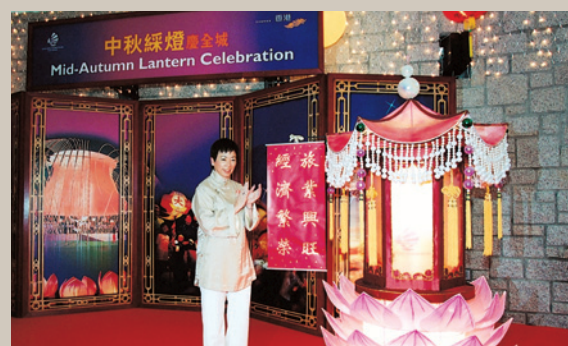
The Mid-Autumn Lantern Celebration was based around one of Hong Kong's most popular festivals