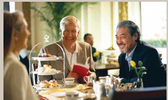
Business visitors accounted for more than 30% of overnight arrivals in 2003 2003年在港逗留一晚或以上的旅客超過30%是商務旅客