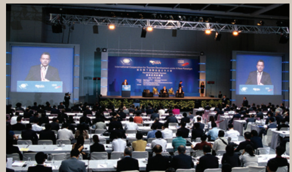
The Revitalising Asian Tourism conference underlined Hong Kong's role as the Events Capital of Asia

「博鰲亞洲論壇」選擇在香港舉行推動亞洲旅遊業復甦的會議，更顯香港「亞洲盛事之都」的地位