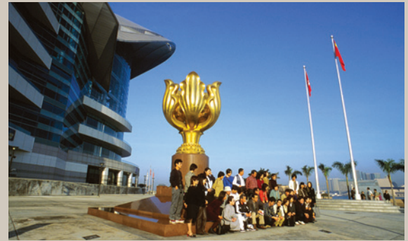
Golden Bauhinia Square is a popular attraction among Mainland visitors 金紫荊廣場是備受內地旅客歡迎的旅遊景點

事實上，香港與內地關係密切，為旅遊業帶來多方面的裨益。2004年6月成立的泛珠三角區域，9個省份加上香港和澳門，同意在10個範疇，包括旅遊業及運輸業方面廣泛合作；此外，「個人遊」政策推行至今，整個廣東省以及內地其中11個最富裕城市超過1.58億居民都可以個人身份來港旅遊，而這些政策以及其他機制均有助香港旅遊發展局(旅發局)把香港定位為內地旅客出境，以及海外旅客進入內地的「必經」旅遊勝地，無論內地的出境或入境旅遊，香港都能從中享受「雙贏」。