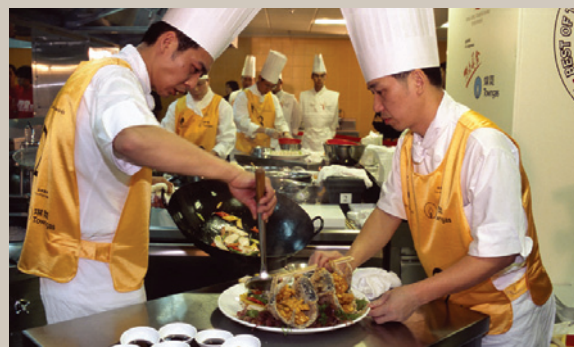
Top Hong Kong chefs vied for the honours in the 3rd annual Best of the Best Culinary Awards