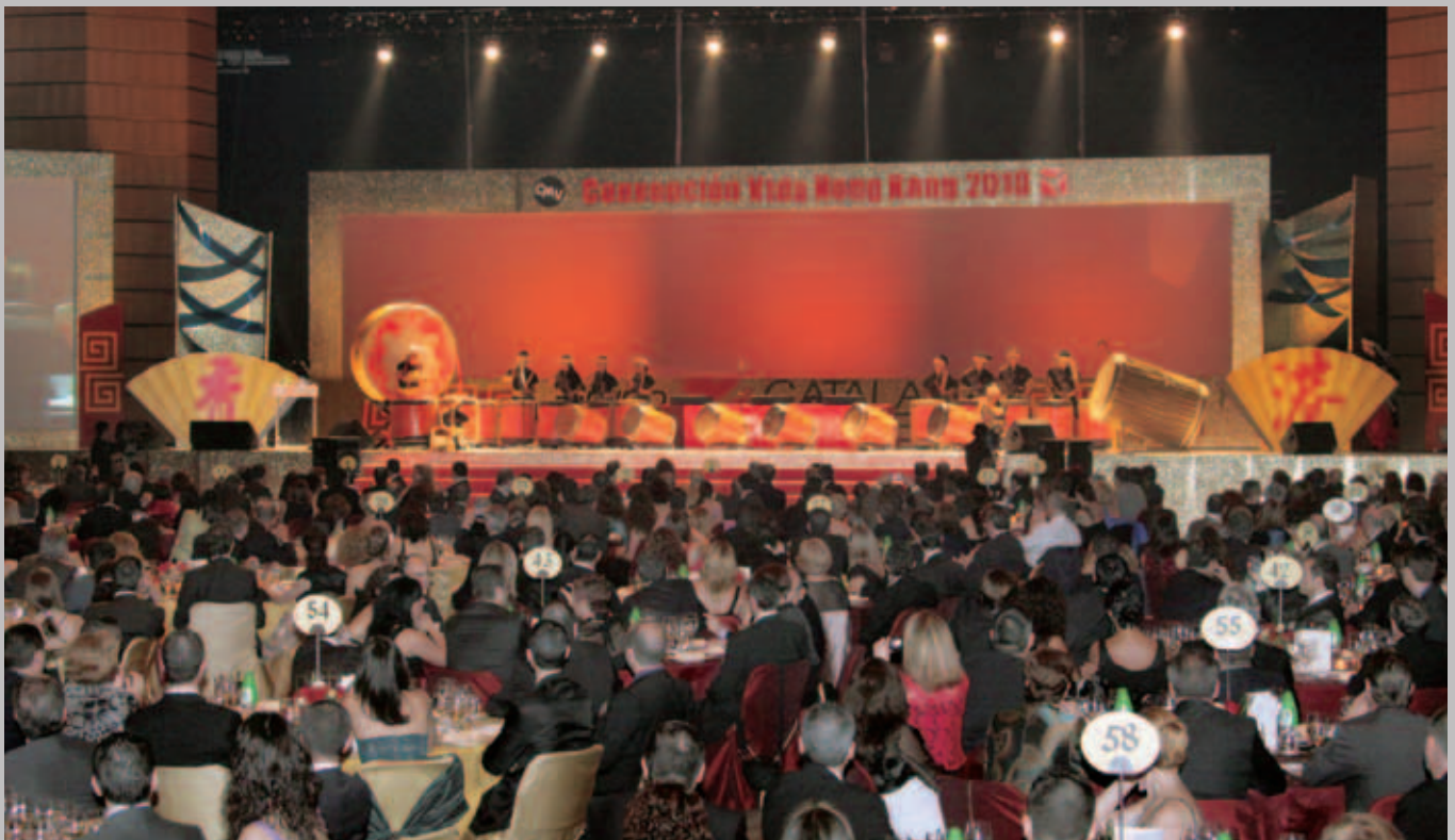
Chinese drum performers entertained the guests at the Grand Hall of the HKCEC.