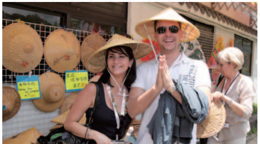
The Spanish guests liked to try on traditional Asian hats – and perhaps pretend that they were Buddhists for a day ...