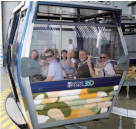
The Ngong Ping 360 is a spectacular 25-minute cable-car-ride.

has organised trips for its employees to destinations around the world as an incentive, as well as a motivation-booster.