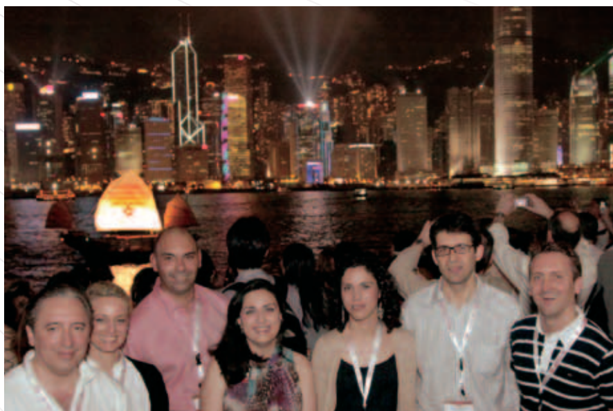
Hong Kong by night offers tremendous views of everything from modern skyscrapers to old sailing junks.